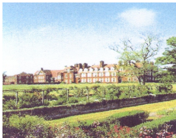
Saint Felix School, Southwold IP18 6SD

you bring your bokken and jo, plus of course the all important proof of BAB insurance. Contact 01502 565374/515062 or www.broadland-aikido.co.uk for more information.